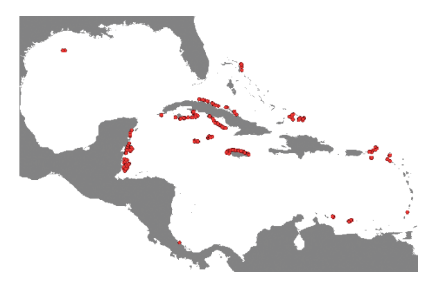
Figure 1. Map of the Caribbean indicating the locations sampled. Filled circles, sampled sites.

methodology to sample the status of different coral reef guilds all throughout the Caribbean (www.agraa.org). In this paper, we used the surveys carried out in the shortest interval of consecutive years that had the largest number of locations sampled to avoid temporal variations in the guilds while increasing sampling size. In the light of this condition, our analysis has to be interpreted as a snapshot of the potential drivers of coral reef change. The surveys used were those carried out between 1999 and 2001. Those surveys were located in 322 reef sites belonging to 13 countries of the Caribbean (figure 1). The sampling comprises the broad variety of sites that may be found in the region like coastal, island and oceanic reefs with varying degrees of human densities and exposure to environmental factors. Such a sampling is likely to maximize statistical variation, and therefore provides a good proxy to assess the general causes of coral reef change in the Caribbean. We only used data from the sites located in the forereef to have a standard comparison among sites. We also included species richness in the analyses to assess potential variations in community structure along gradients of coral reef diversity. For each coral reef community, we quantified the biomass of carnivorous and herbivorous fishes, coral mortality and the abundance of macroalgae and Diadema antillarum (see extended details in the electronic supplementary material).